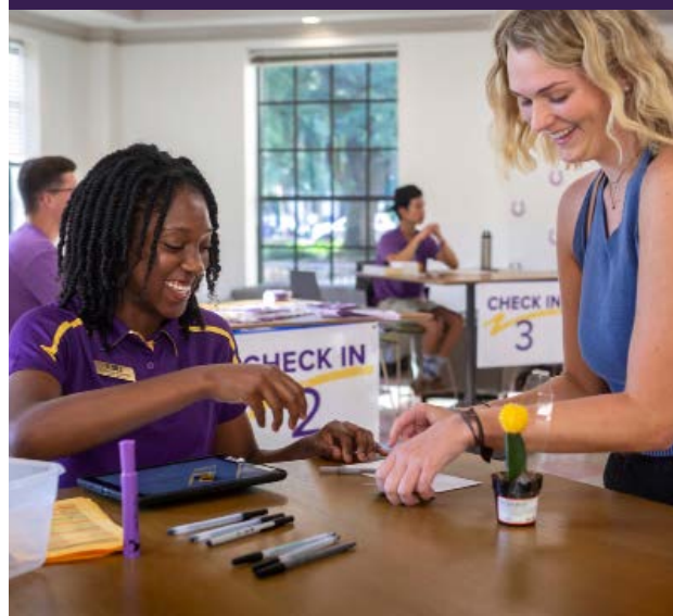
Balancing student development and community logistics gives RCs opportunities to make decisions and build skills.