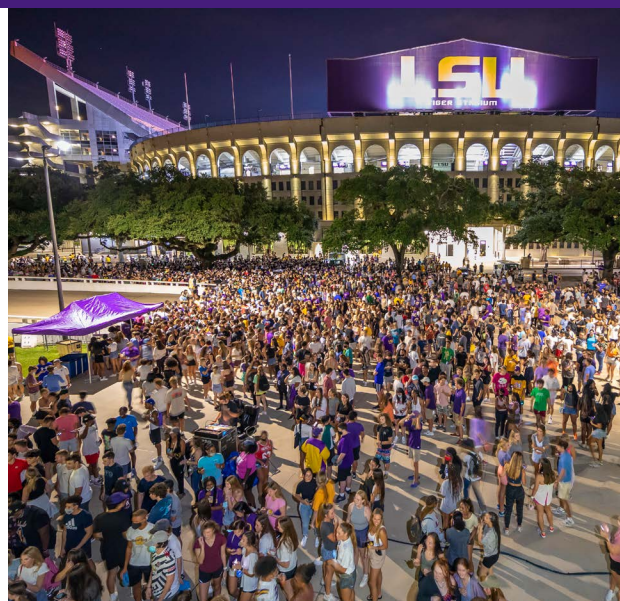
After hours and weekend work is part of showing up for students where they are, like this Welcome Week block party hosted by RHA.