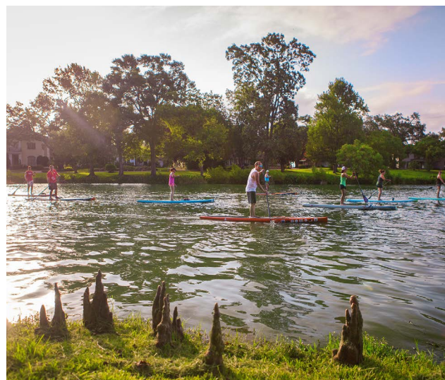
Louisiana’s wildlife and nature is unrivaled in beauty.

#1 MIDSIZED CITY FOR BUSINESS COST FRIENDLINESS KPMG, Competitive Alternatives, 2016