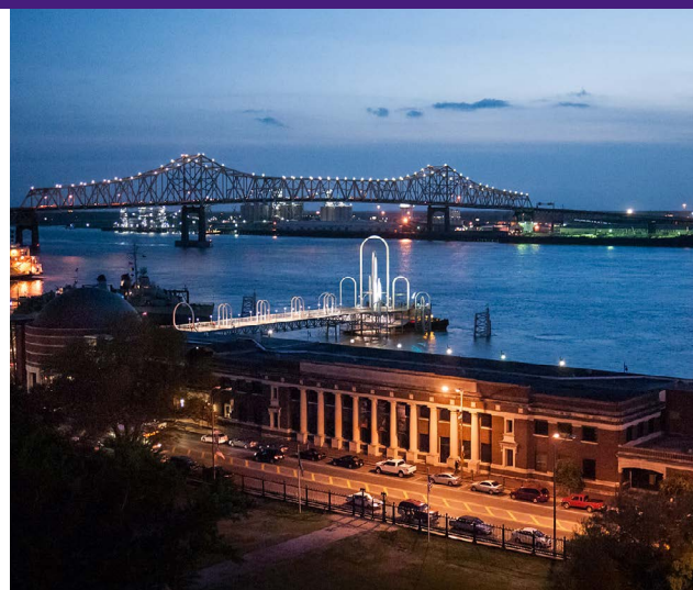
Downtown Baton Rouge has numerous leisure, culinary, and cultural activities in which to participate.

Our city boasts award-winning public and private school options ; more than 900 restaurants ; live concerts ranging from home-grown favorites to superstars like Kenny Chesney and James Taylor; a world-leading medical research center ; a variety of museums , including one that houses a 65-million year- old triceratops skull and a 5,000-year-old mummy; a nationally recognized, award-winning public library system ; more than 180 parks across the region; and much more. No matter your age or interest, the Baton Rouge Area is a great place to call home.